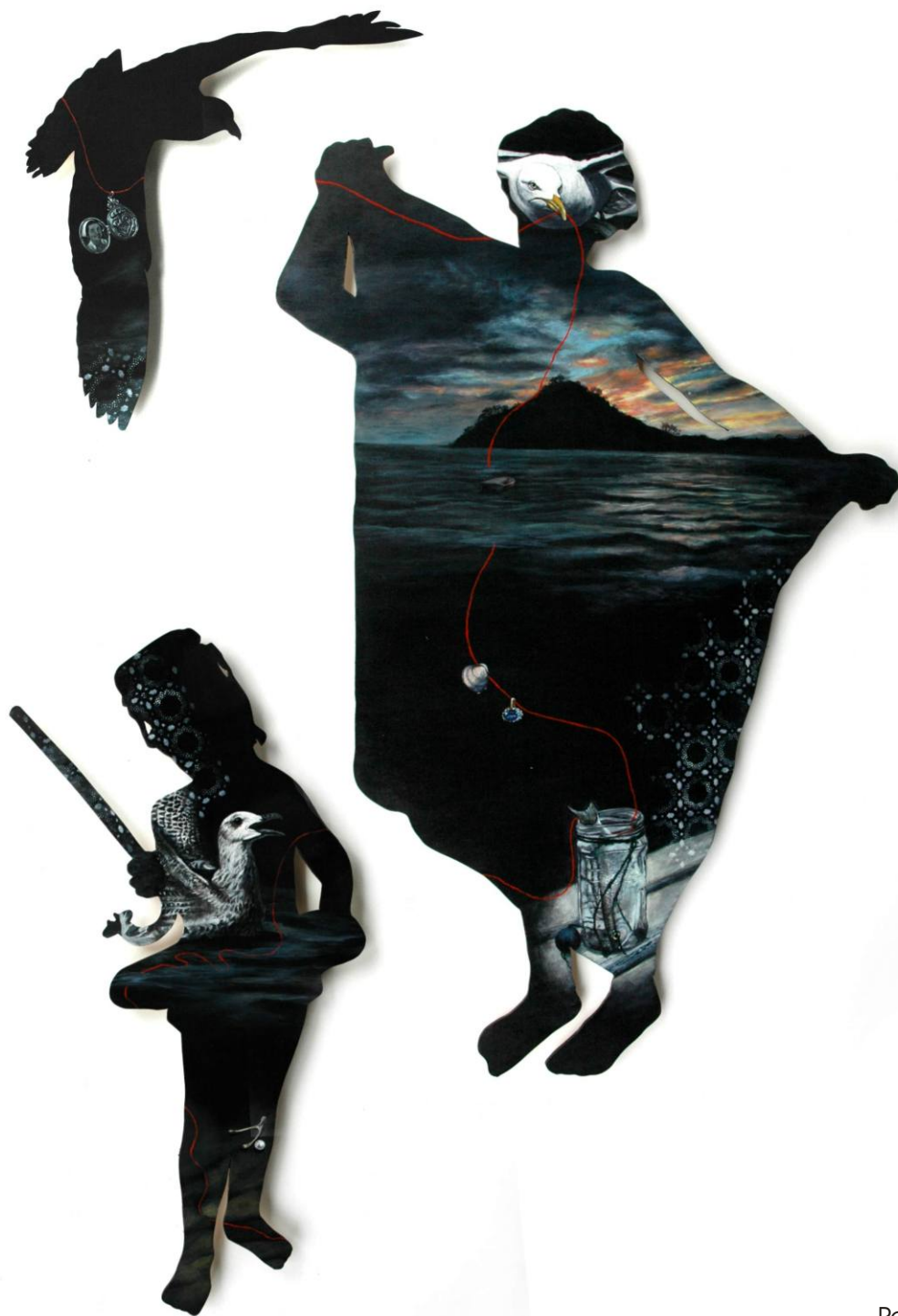
Molly's Tide Penny Howard 2009