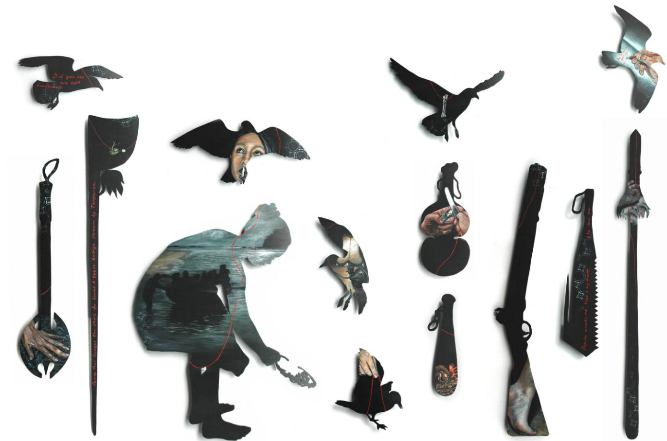
Atārangi Whenua Penny Howard 2009