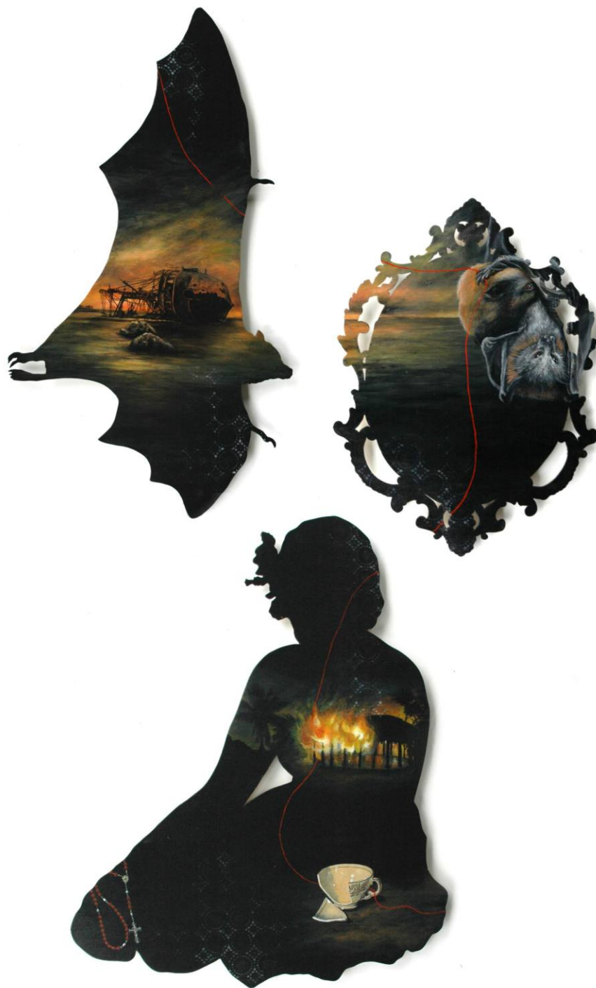
The War of 1899 Penny Howard 2009